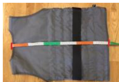
Measurement for the length at centre back.