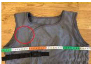
Measuring for the largest measurement for the size. None of the Velcro strip is visible.