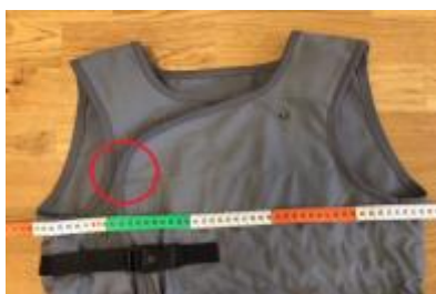
Measuring the smallest measurement for the size. No seam overlap.